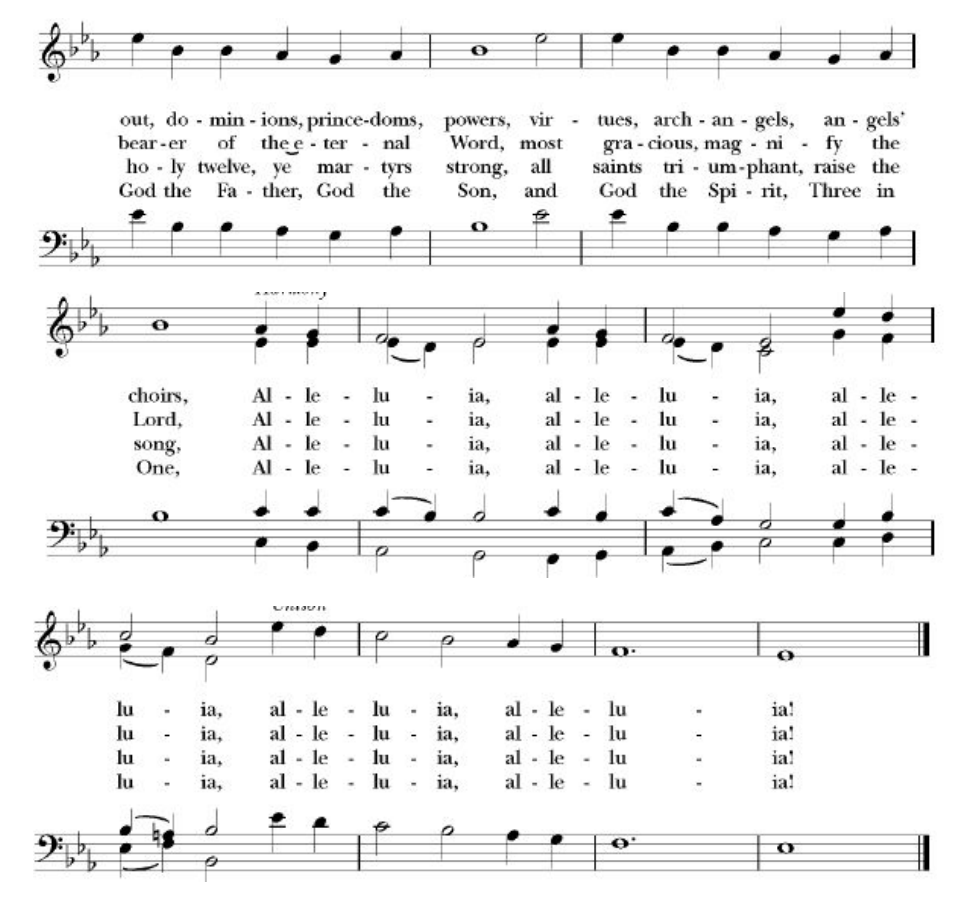
Postlude Prelude in E-flat major